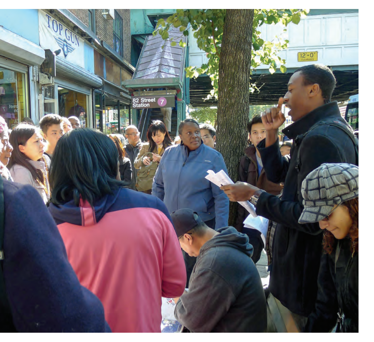
Students go out into the city through pray and break bread.NYC in Queens, NY